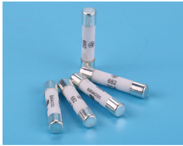
Dimensions (unit: mm)